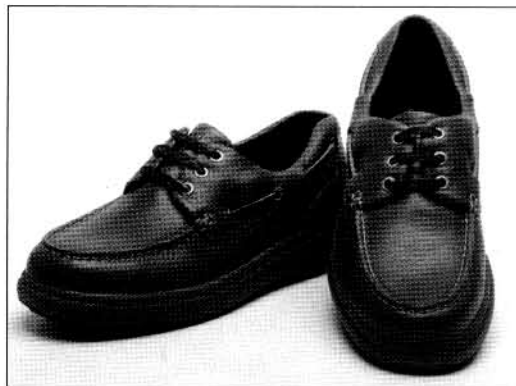
SureFit UltraLITE Cruiser

It is virtually impossible to fit all of your patients using one style or last. SureFit UltraLITES are built on different lasts to accommodate various foot shapes and deformities. Using our simple